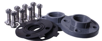
Kit Flanges includes: 2 brides, 2 seals, SS hardware